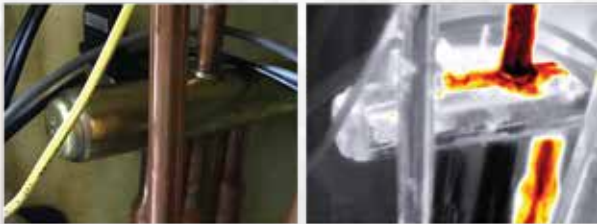
FAILING REVERSING VALVE